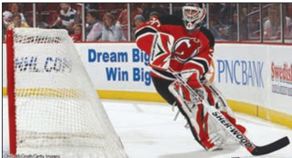
New Jersey Devils goaltender Martin Brodeur is one of the league's top puckhandlers. His ability to play the puck behind his net allows his defence more freedom to cover the zone in front.

The key to defensive zone puckhandling is the goalies ability to make quick alert puck decisions (what's happening during the game i.e. strong forecheck...soft dump ins, etc), with great communication between defenceman and goaltender. Do this and your team will get the puck out of your zone in a quick effective manner.