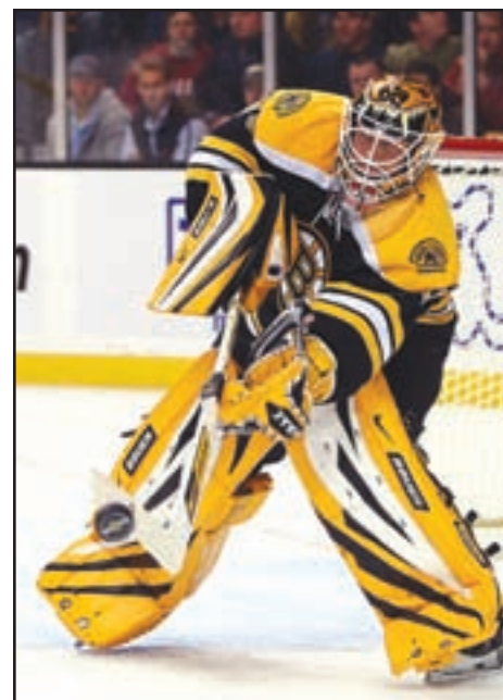
Tim Thomas of the Boston Bruins feeds the puck up to his team as they move up the ice. Quick reaction to a dump in like this can help turn your squad back up the ice quickly.